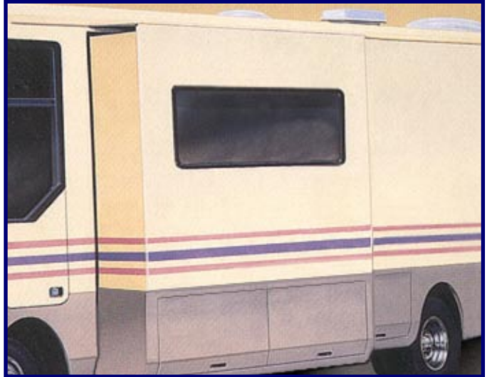
Exterior of room and coach.